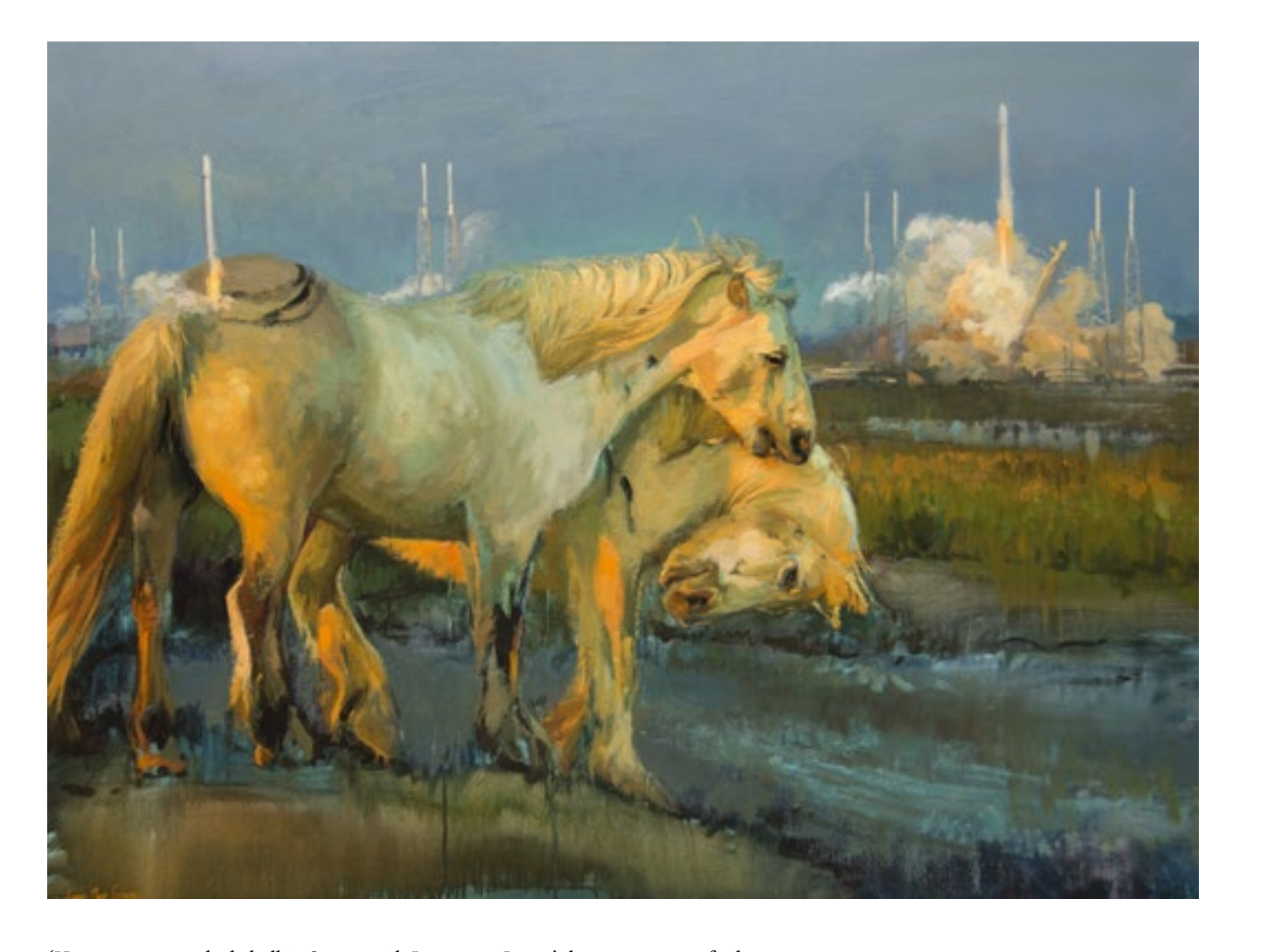
'Hear we are on a little ball in Space, with Lessons to Learn' the space race to find a new Earth.