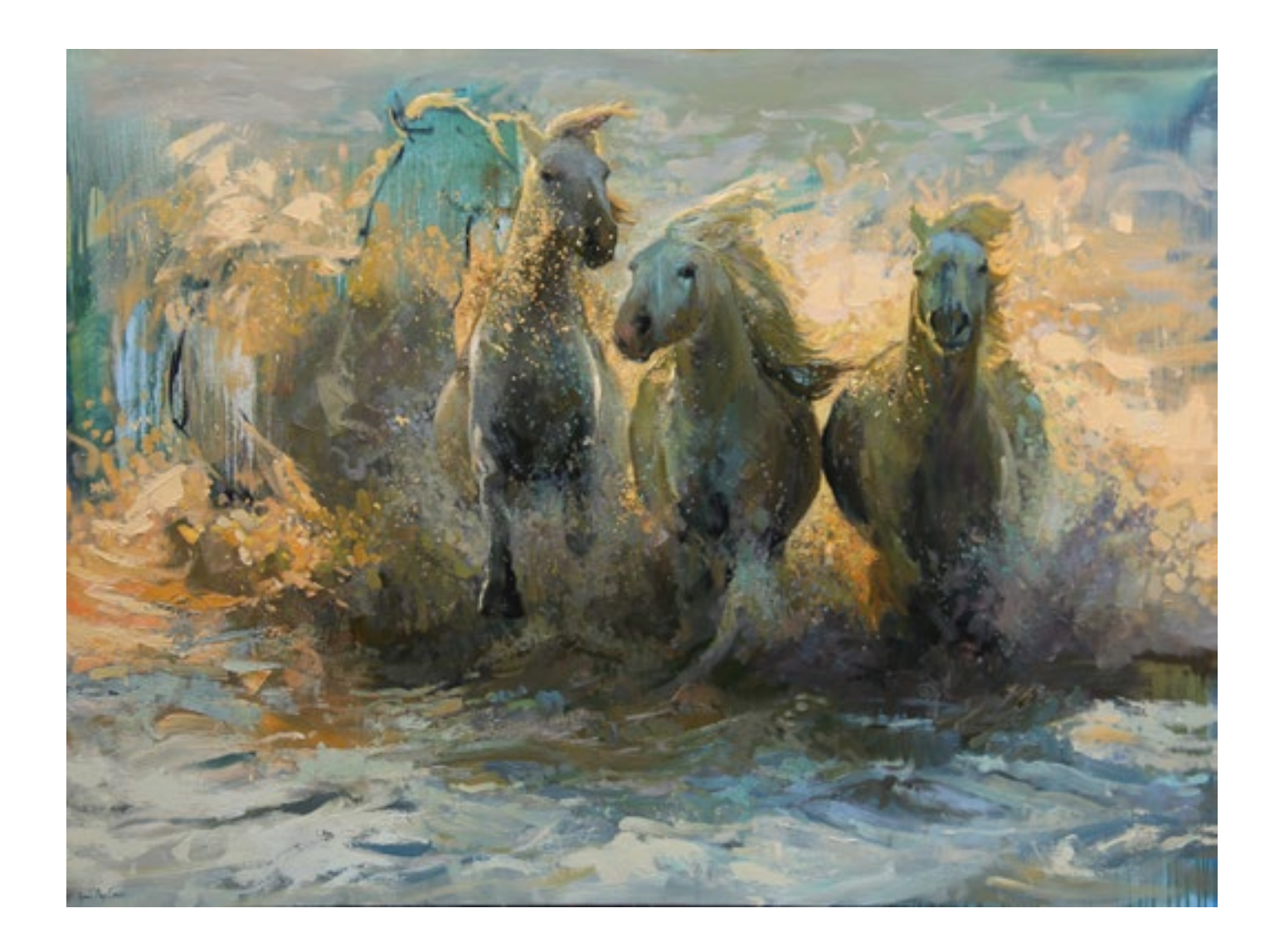
The Gift of the Givers