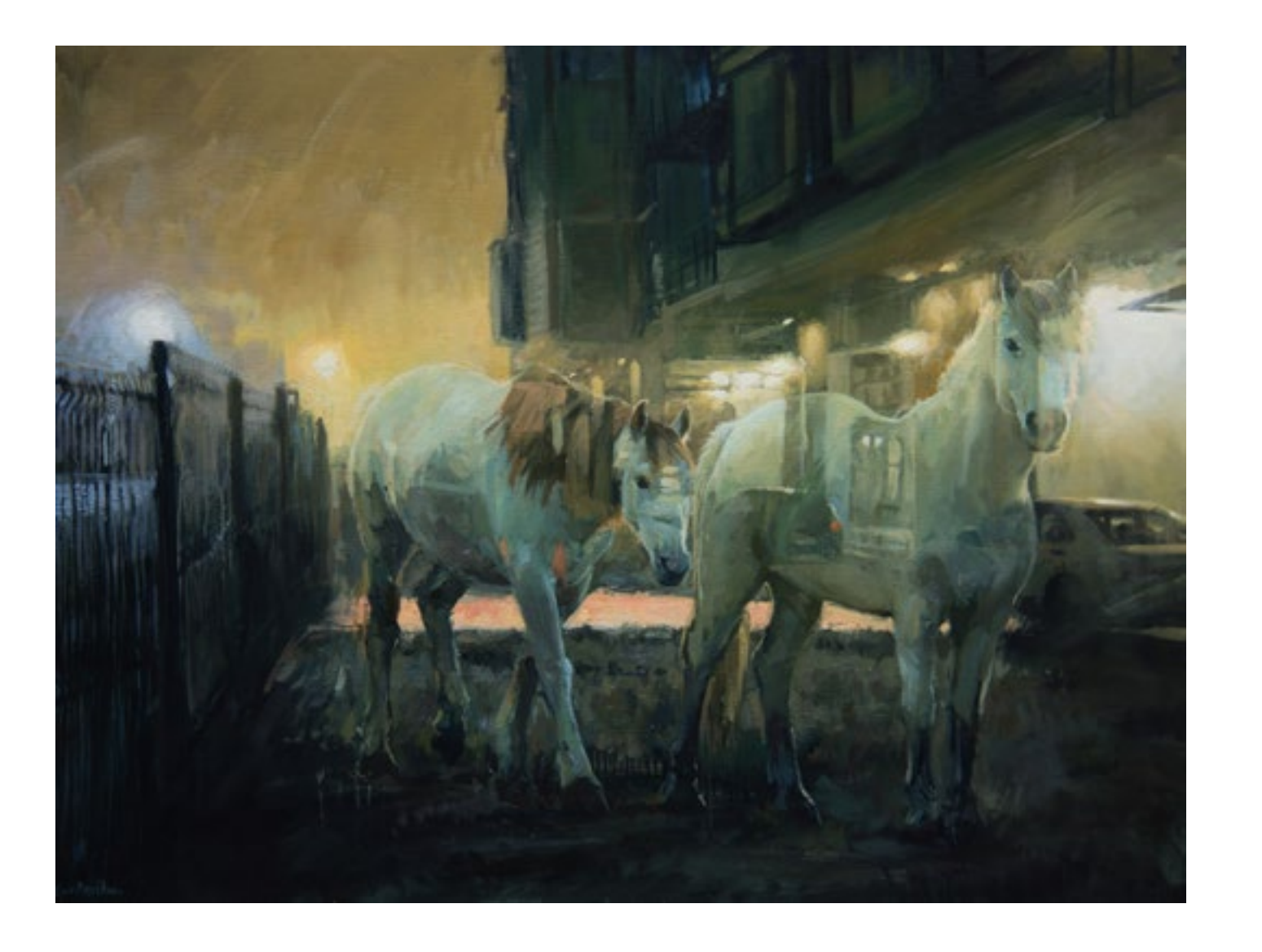
What lies Beyong the Fence