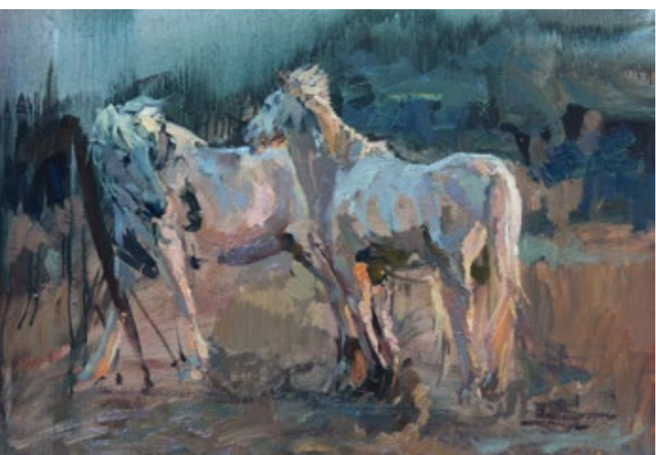
Wild Within Our Nature