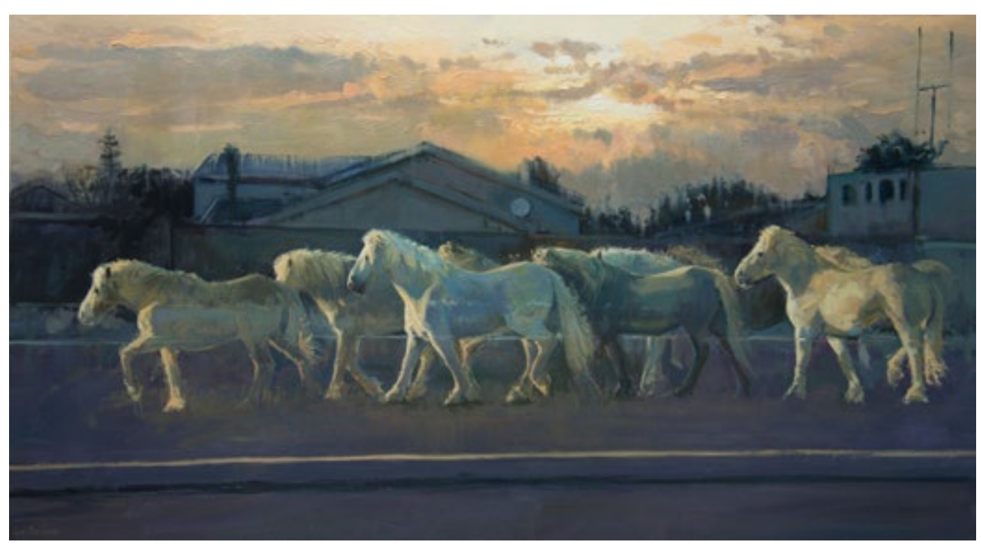
Plenty of time to think about it?