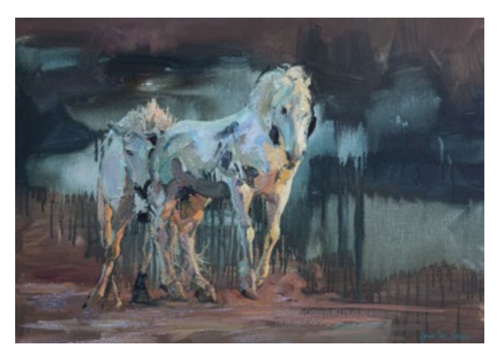
Play Within Our Nature